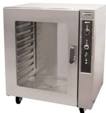
DPW10 10 pans