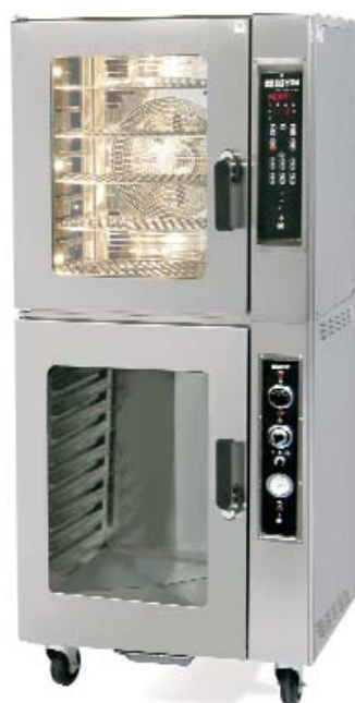
JA5P2618 + DPW10